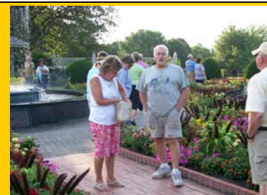
Photos from our trip To Munsinger Gardens