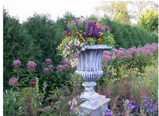
Picture taken on our cruise to the Munsinger Gardens